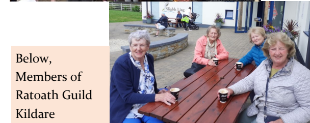
Below, Members of Ratoath Guild Kildare Federation table quiz