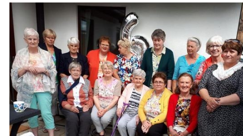
On left, 60th Anniversary celebrations of Borris-in-Ossory Guild in Laois Federation