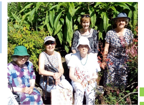
On left, members of Carlow Federation visiting Altamont Gardens