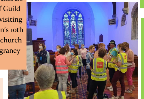
Right, Members of Scarrif Guild in Clare visiting St Cronan's 10th Century church in Tuamgraney