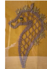
Some examples of Bobbin lace done at An Grianán recently.