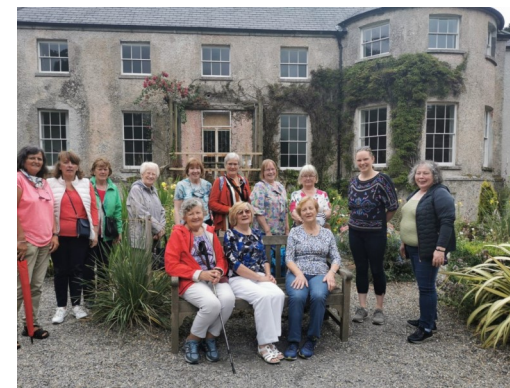
On right, Members of Ashford Guild Wicklow Federation enjoying a summer outing.