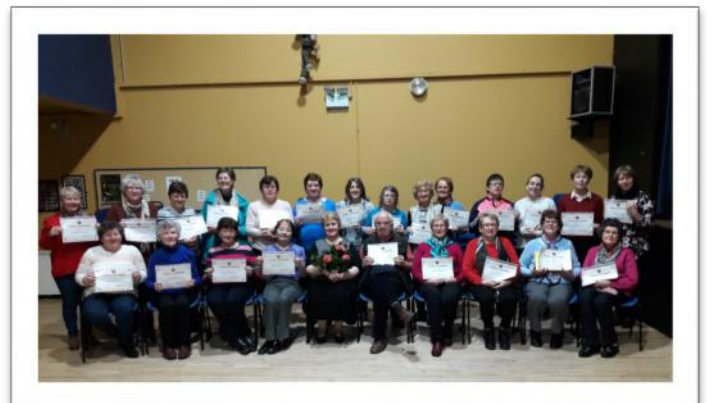
Moyvane Guild along with friends received our Certificates of Participation in an HSE led Health & Nutrition Course.