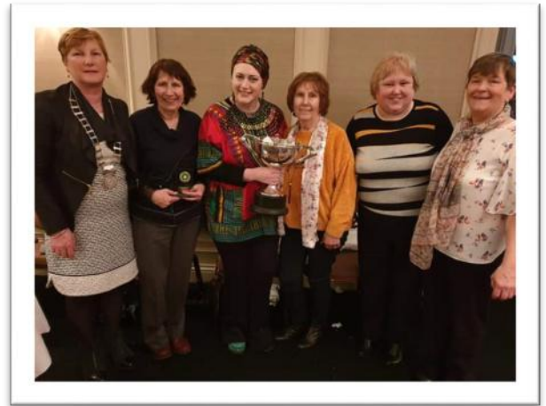
Corofin Guild members - the winners of the International women's day competition.

Well done to all guild for taking part and their work, research and presentation was a credit to them.