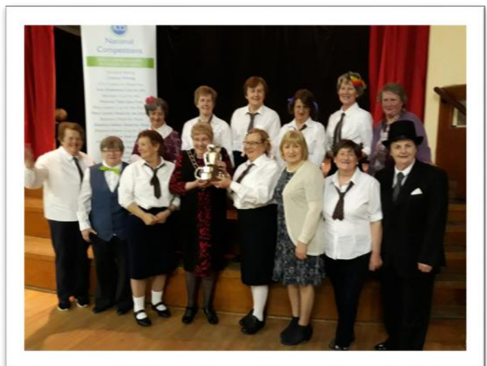
Cappamore Guild, Limerick Federation winners of the Eleanora Gibbon Cup for Drama