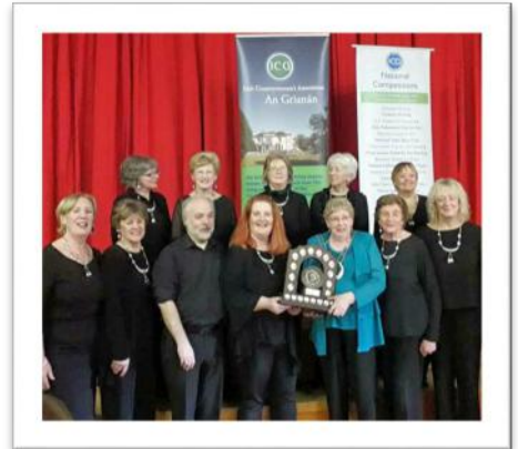
Ashford Guild Wicklow....winners of the Baumann Shield for music

Well done. The Kellogg Hall was full to capacity. “